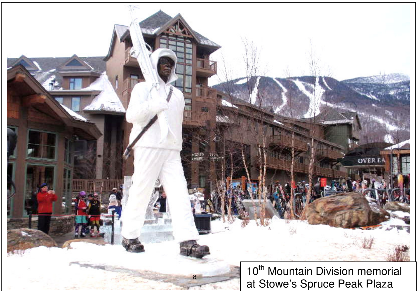
10 th Mountain Division memorial at Stowe's Spruce Peak Plaza

Schenectady Wintersports Club Northern New York Paddlers PO Box 228 Schenectady, New York 12301