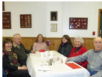
"Vegging at the VFW"